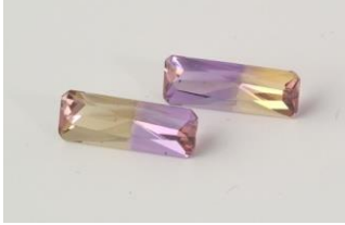
Scissor Cut matched pair 13x4.7mm 3.92ct TTW QAMF0112-10 Price $98