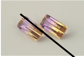
Bar Cut matched pair 13.5x6mm total weight 6.71ct QAMF0112-8 Price $169